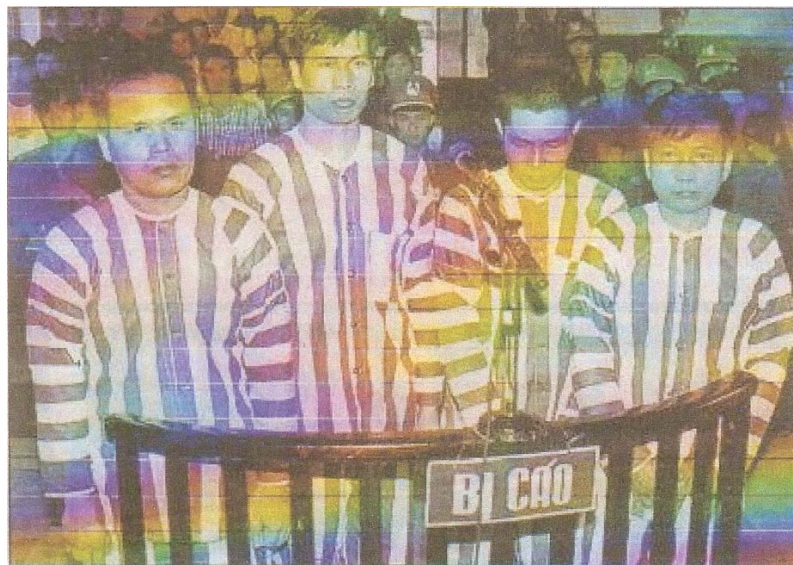
Taking a stand: The four separatists appear in court on Thursday. They were sentenced to up to 13 years jail after being charged with undermining state policy.